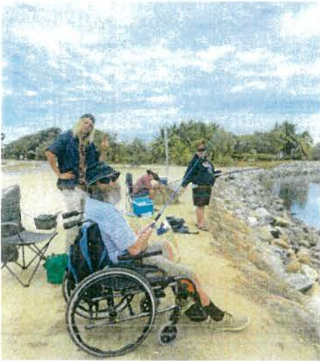
Enjoying a spot of fishing at Bowen Harbour